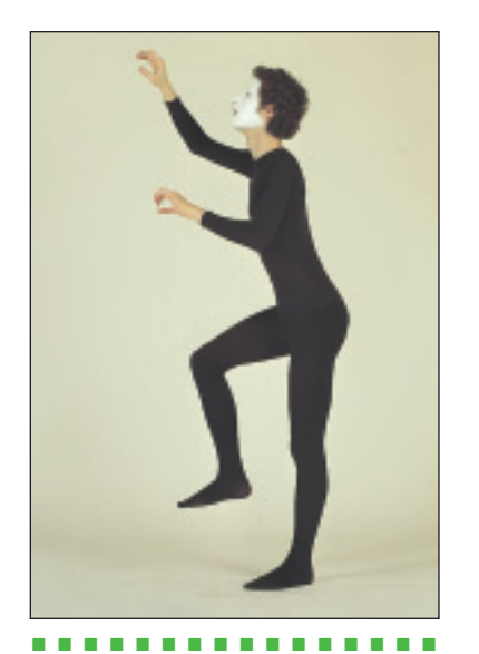
A talented mime can make you believe he is actually doing what he is only pretending to do.