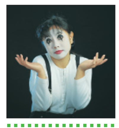
Can you communicate effectively with facial expressions and gestures? If so, you might enjoy being a mime.

perform the following imaginary actions without talking: writing a letter; picking up a glass of cold water; drinking a cup of hot chocolate; eating a jumbo chocolate chip cookie in three bites.