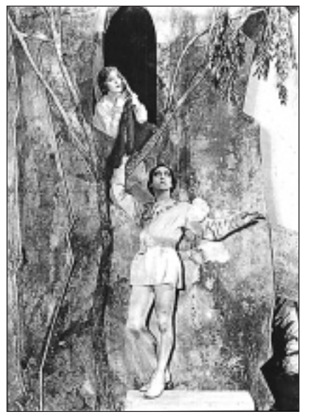
Comparing this scene from Maeterlinck's Pelléas and Mélisande (1892) to the Ibsen scene on page 231 will help you see some of the differences between realism and symbolism.

Because of the symbolic use of props and set pieces, the mood of a symbolist play is often more