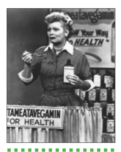
Lucille Ball was such a talented pantomime artist and comedienne that her I Love Lucy shows are being enjoyed on cable television networks over forty years after they were first produced.

story line will help the audience understand what is happening in your presentation. Don't cloud the story with too many details. Accuracy in pantomime makes the presentation believable and precise. Consistency keeps all the items in a pantomime the same size, shape, weight, and in the same place. Exaggeration makes the actions in pantomime bigger than life, helping the audience see your action with more clarity.