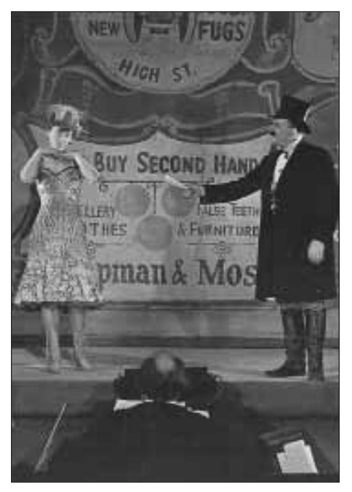
Vaudeville shows, which entertained large audiences with musical numbers and comedy sketches, were among the first steps in the development of the great American musicals.