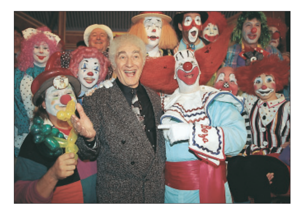
Generations of children have laughed at Bozo the Clown.