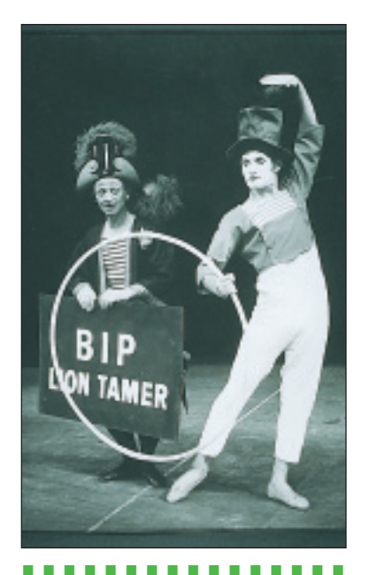
The most famous mime in the world is probably Marcel Marceau.